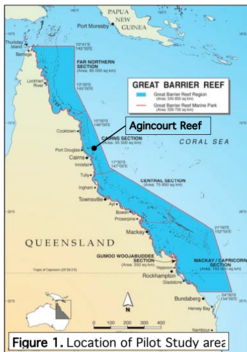
Figure 1. Location of Pilot Study area

Agincourt 2D Reef is a planar reef of approximately 310 ha situated close to the southern extent of the Agincourt group, approximately 29 Nautical miles NE of Port Douglas, Queensland, Australia ( Figure 1 ). A tourism pontoon has been in operation at Agincourt 2D Reef since 1984.