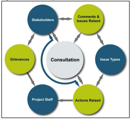
Figure 2: Relationships in the SCD

The principal concern of the project was a system that could service the entire lifecycle of the project, and the effective management of stakeholder consultation data, ensuring that the relationships between stakeholder, stakeholder feedback, keyword, meeting and grievance were all stored in a system that was easily understandable and accessible. Figure 2 shows the relationships developed in the SCD.