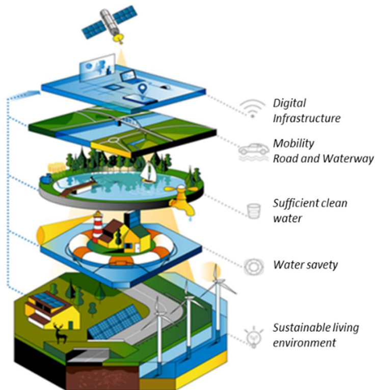
Foundation of the tasks of Rijkswaterstaat, a sustainable living environment

Need for innovation in order to gain support and use the knowledge available within society: