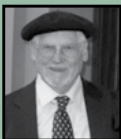
CHARLIE WOLF MEMORIAL LECTURE

Monday 29 April | 08:30-12:00 Pre-registration is required. $10