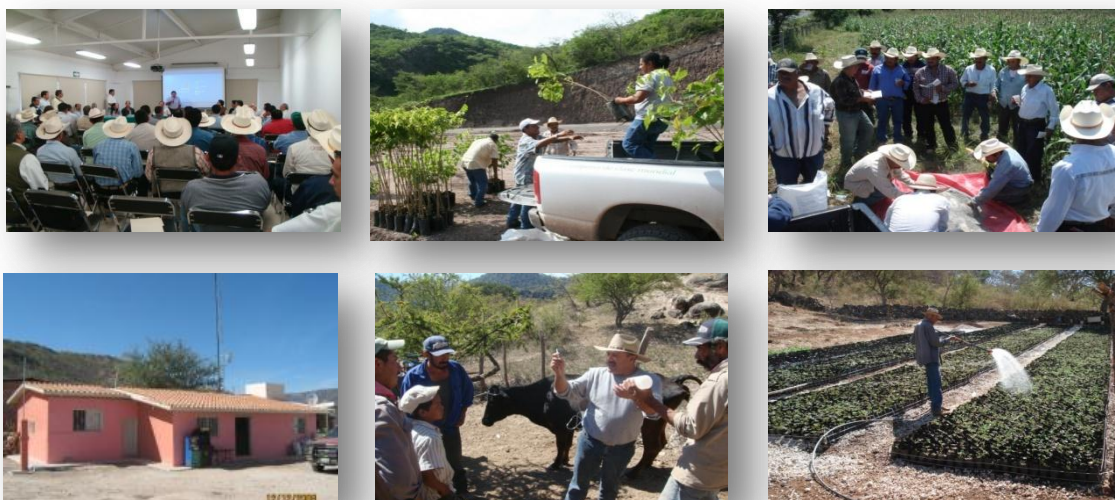
Programs and Actions applied to Environmental Social Aspects.

Application of EIA's terms and conditions in both, environmental and social aspect has proven to be on great importance for infrastructure projects success. Serving as a working guideline, most permits, authorizations and concessions are not only too much easier to obtain at every level; at the end, both aspects traduce in a better life quality for people; This is the reason CFE has been working on.