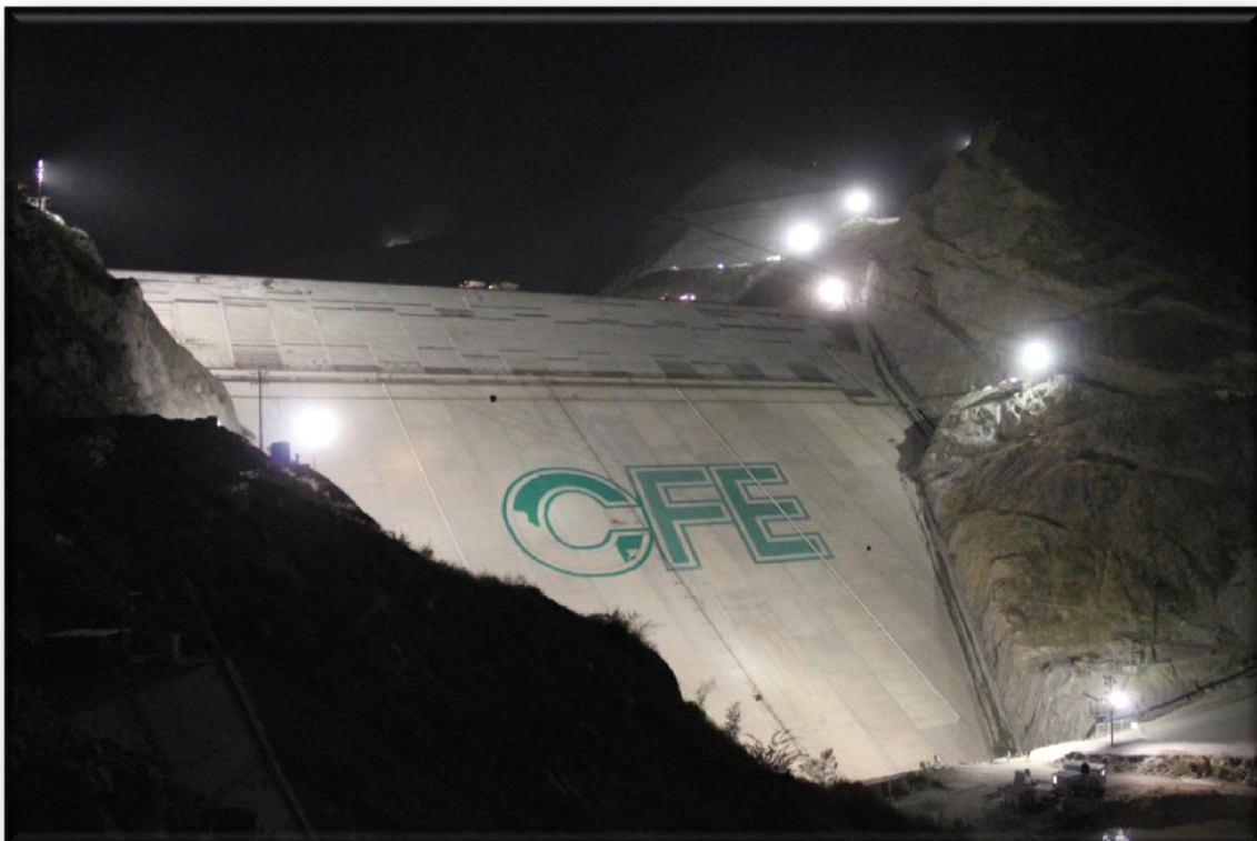
La Yesca Hydropower Project's Curtain.