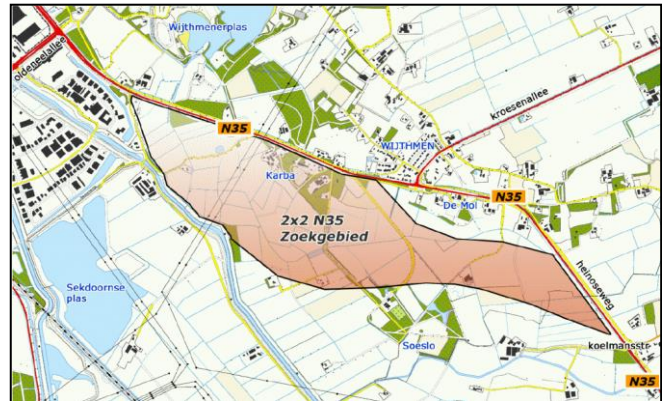
Figure 2 The N35 road widening project Zwolle-Wijthmen