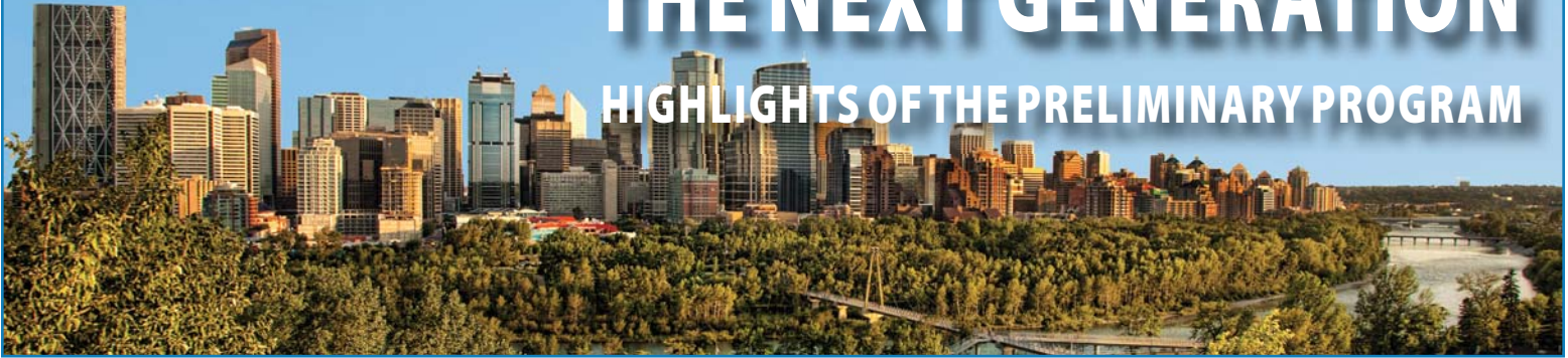
Calgary skyline.