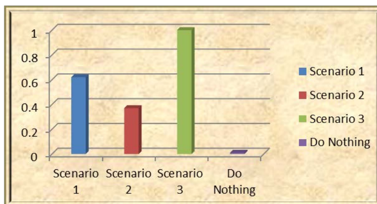
Diagram 1: Hierarchy of the Scenarios expected efficiency.

The results of the Regime analysis are presented in the following diagram.