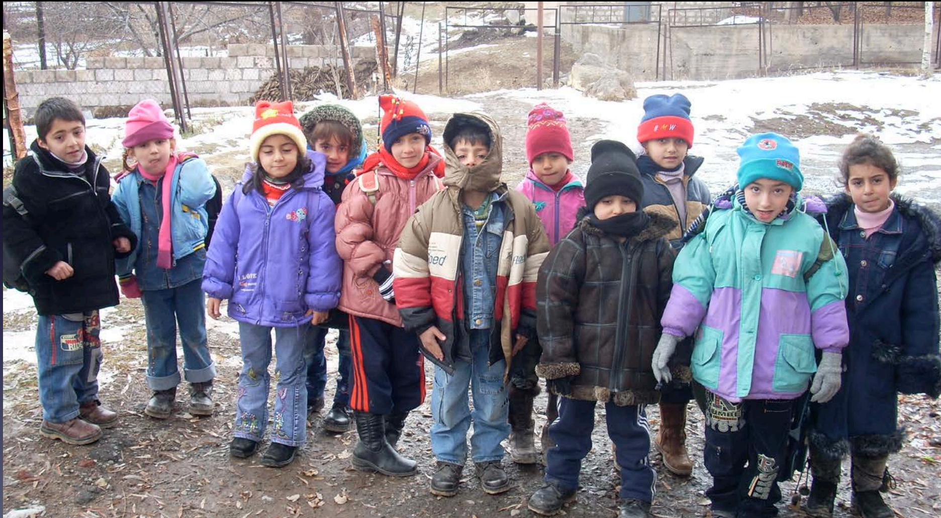
School children, Armenia, the “target population” of the social part of an E/SIA