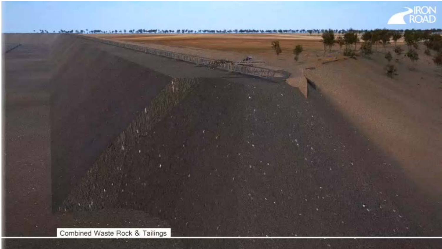
Combined Waste Rock & Tailings