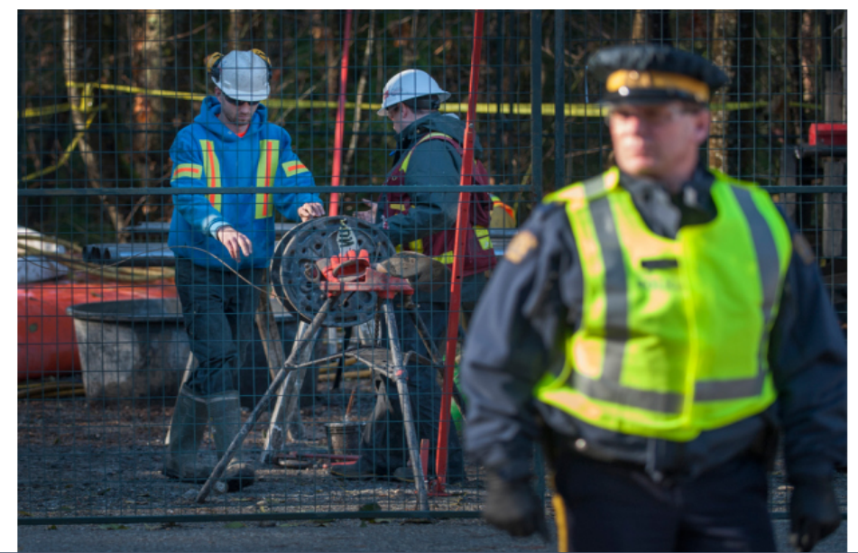
Protest to Kinder Morgan TransMountain Pipeline, Burnaby, BC

NP TIFFANY CRAWFORD, POSTMEDIA NEWS | November 28, 2014 11:10 PM ET More from Postmedia News