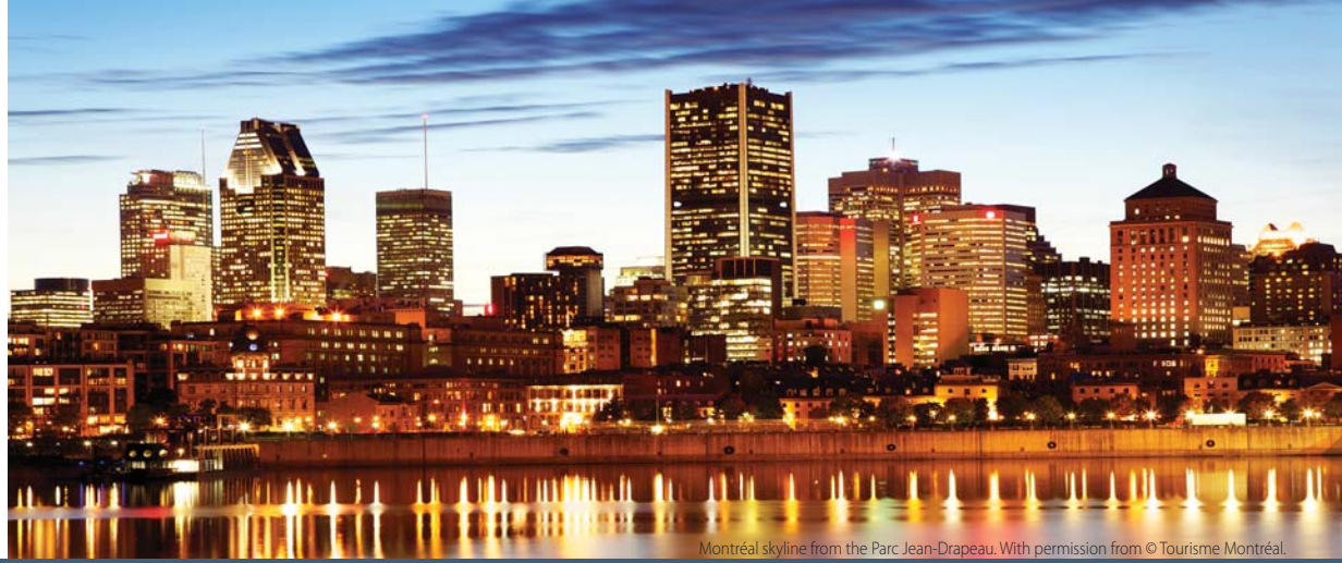
Montréal skyline from the Parc Jean-Drapeau.

4-7 APRIL 2017 LE CENTRE SHERATON MONTRÉAL HÔTEL MONTRÉAL, CANADA