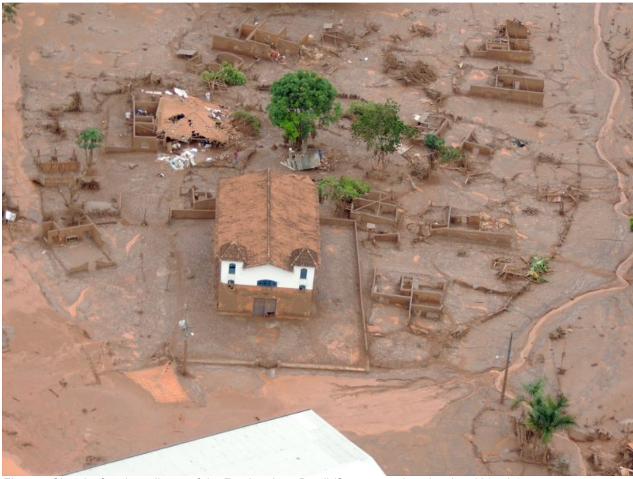
Figure 5 Church after the collapse of the Fundao dam, Brasil.