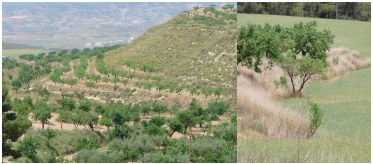
Figure 2 Traditional vegetated earth-banked terraces in Murcia, Spain.

In various countries, different cultural heritage practices contribute to prevention and mitigation of flood risk, often coupled with the traditional land use systems. For example, in the Guadalentin catchment in Murcia, Spain, vegetated earth-banked terraces are implemented already in historical times. These terraces help to reduce the formation of gullies and retain water from upslope, thereby mitigating flooding, as well as reducing the impact to infrastructure and siltation of water reservoirs. The terrace ridge act as a sink to reduce the velocity and runoff, while the vegetation on the terrace improve the soil structure and increasing the water infiltration capacity (De Vente, 2011).