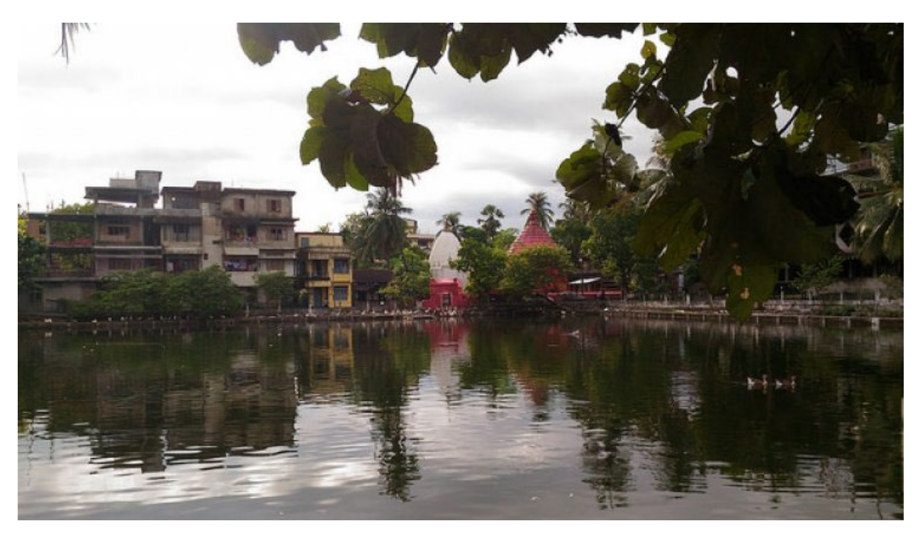
Figure 3 Jorpukhuri pond near the Ugratara temple in Guwahati, India.