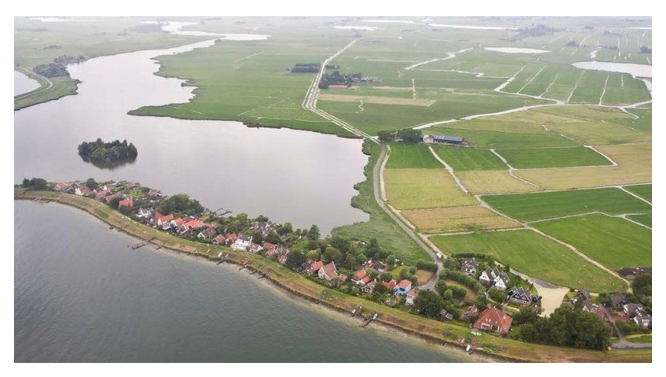
Figure 4 Historical buildings on the dike, town of Uitdam at the Markermeerdijk (Source: Markermeerdijken.nl).

impact of the flood risk management plan resulted in the plan to be withdrawn (Waterschap Limburg, 2017).