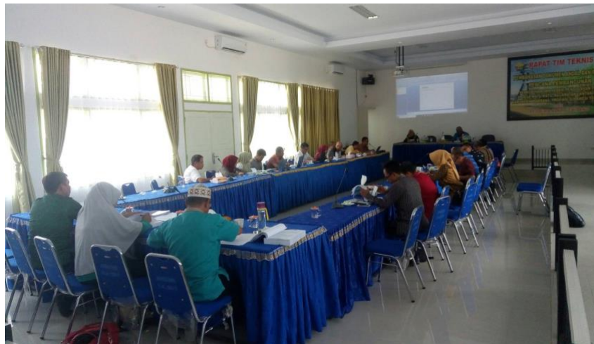
Figure 1. EIA's Public Consultation in Indonesia

Ideally, public participation and consultation are an arena of ideas and comments by experts and involve the public openly. However public participation in developing countries is also characterized by pseudo-participation and selective involvement rather than broad participation (Marzuki 2009). Moreover, public participation is often treated as a procedural exercise instead of a living process (Nadeem and Fischer 2011). Thus, more than different methods and information disclosure are implemented, the higher the quality of performance in public participation appears to be the methods of achieving public participation and public information accessibility are the key factors in enhancing the development of quality in public