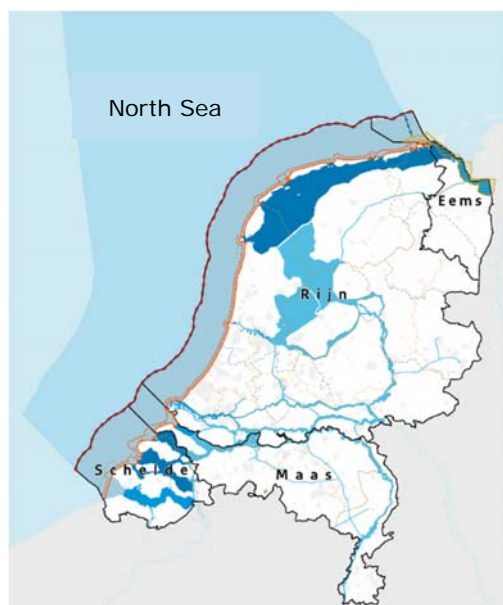
Figure 1: The Netherlands and its main water system

Many countries face enormous challenges regarding water, which are related to the sector itself (quality, quantity, safety), as well as major challenges of climate change, energy transition, biodiversity, agriculture, urbanization, and social inclusiveness. This is certainly true for countries with urbanized deltas such as The Netherlands. The Netherlands is a small and densely populated country, lying in the Delta of 4 rivers (Rhine, Meuse, Scheldt and Ems) that flow into the North Sea. There is water everywhere in the Netherlands. The Dutch literally live with, near and even on water. As a consequence, there are many water challenges the Dutch government has to deal with.