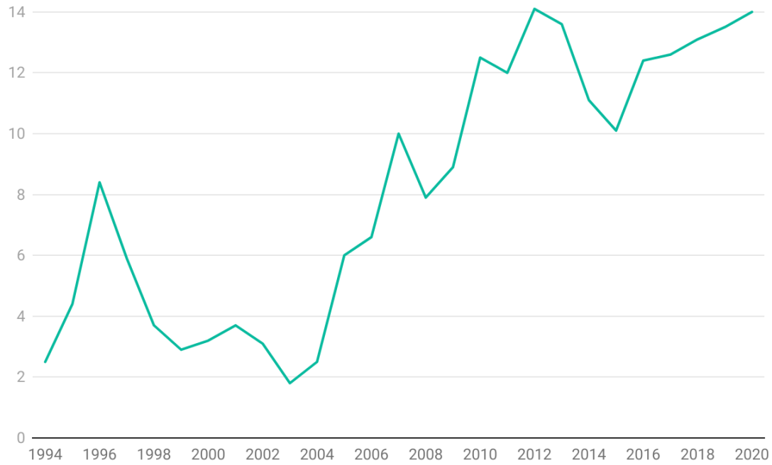
Chart: Open Development Cambodia, license under CC BY-SA 4.0. • Source: The World Bank • Created with Datawrapper

The graph below illustrates foreign direct investment (FDI) net inflows in Cambodia and shows a significant increase from 2.5% in 1994 to 14% in 2020.